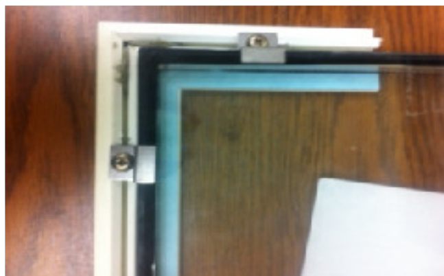
Security Screw Installation