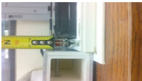
Correct Glazing Tape Compression